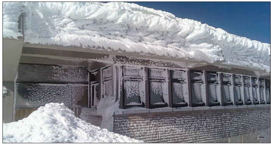
Sherman Adams Summit Building on Mount Washington

Granite State Glass has completed thousands of window and door projects, installing over 100,000 doors and windows for satisfied clientele all over New England. The GSG Team has even installed windows in the Sherman Adams Summit Building on Mount Washington, often referred to as "Home of The World's Worst Weather."