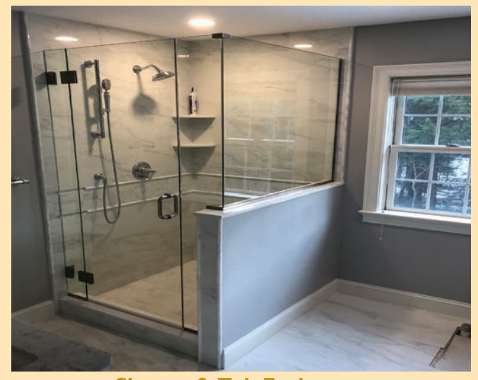
Shower & Tub Enclosures