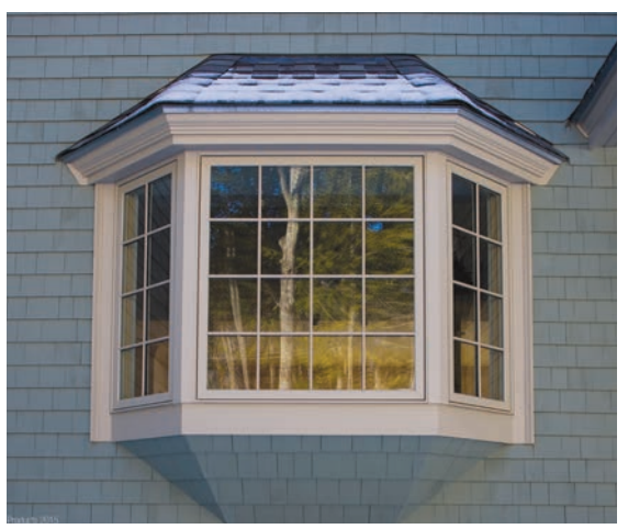
Bays and Bows